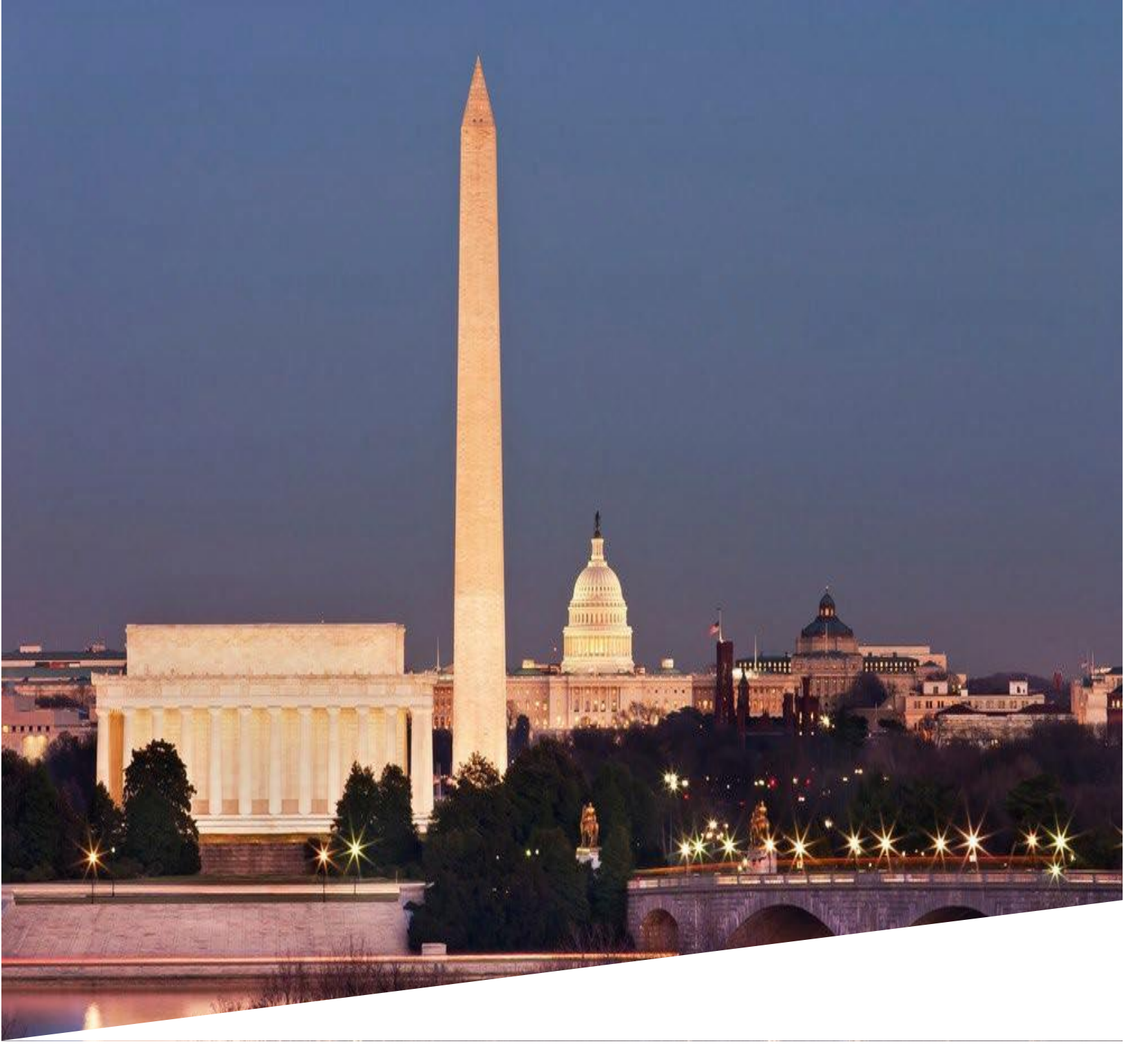
U.S. Commission on Civil Rights