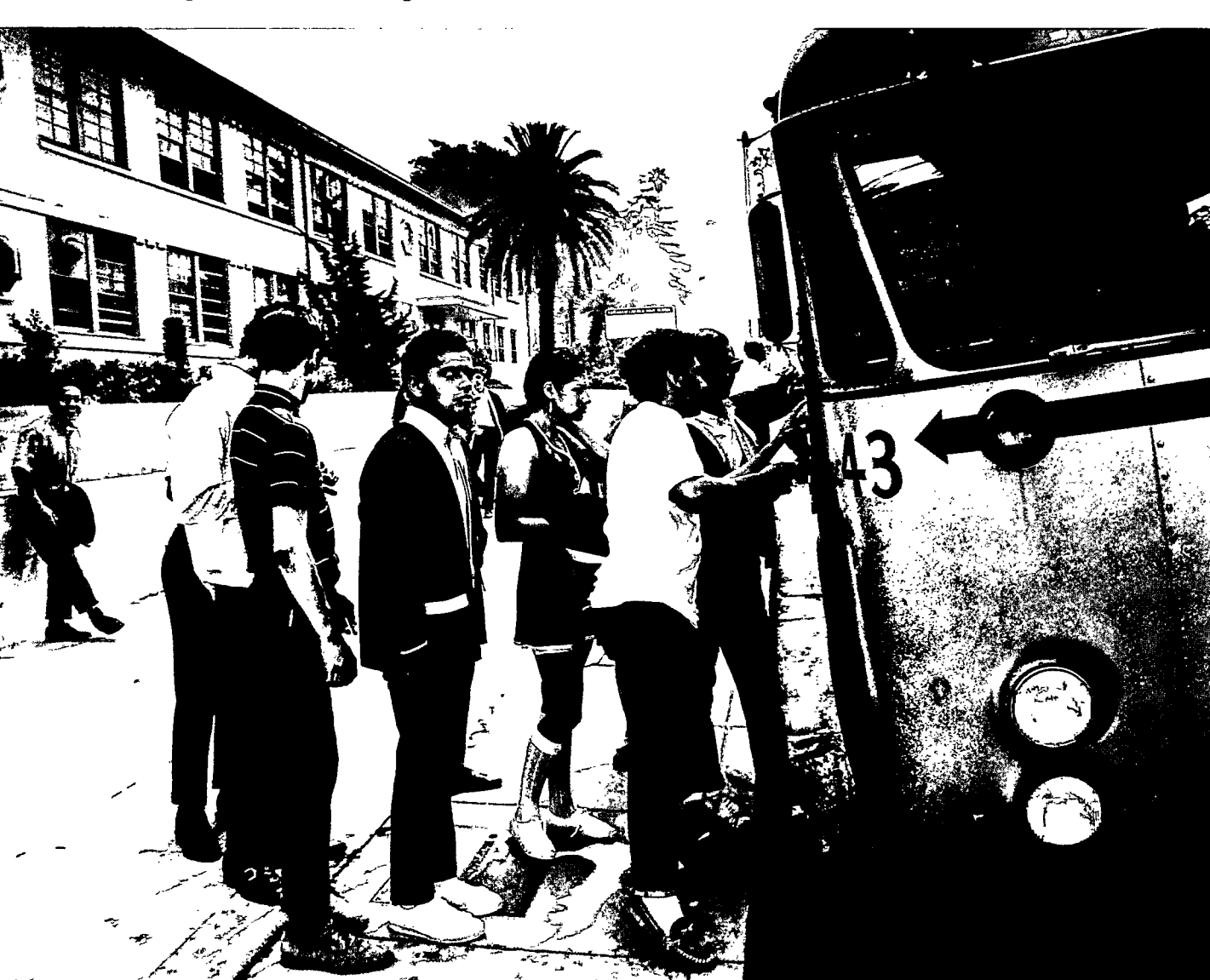
185 Students of all cultures and backgrounds have similar learning needs, but these needs are manifested in different ways. Learning requires a focusing of attention, and attention is dependent on the students' interests. New ideas have to be presented to students in terms and concepts with which they are already familiar. The students must also be rewarded for their efforts in order for them to be receptive to pursuing further learning tasks. The stimuli and setting which meet these conditions vary from person to

Almost invariably those people . . . who enter schools of education are generally ignorant of basic problems and issues regarding culture, traditions, and linguistic differences. And . . . they emerge almost invariably about as ignorant along these dimensions as when they entered. 1866